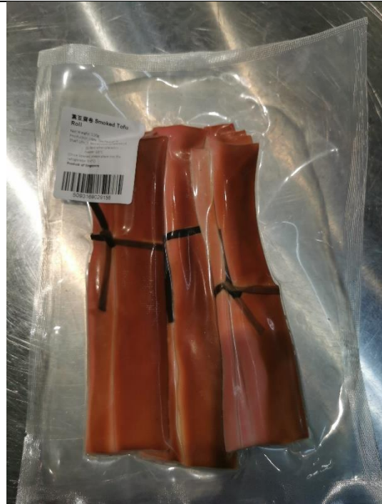
Smoked Tofu Rolls