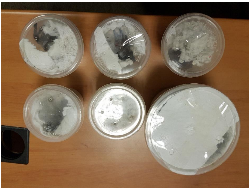
Six live tarantulas were kept in individual containers