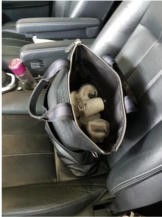
Sling bag placed on the rear passenger seat of the car