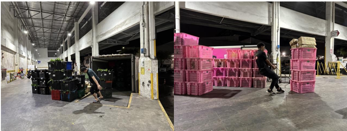
Truck drivers unload the imports for inspection

4 SFA is following up with further investigations and will not hesitate to take enforcement action.