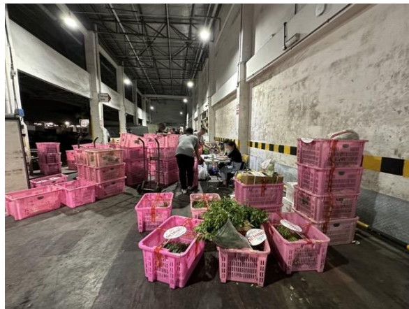
Produce is weighed and the total weight is tallied.