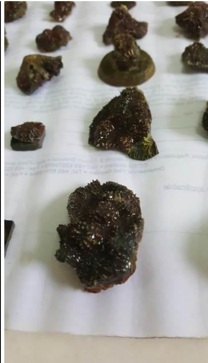
Close up of the smuggled hard corals.