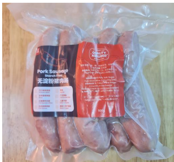
The sausages and meat jerky were made at Hua Xin Foods Pte Ltd's restaurant

4 Investigations revealed that the food products processed and packed by both Hua Cheng Restaurant Pte Ltd and Hui Xin Foods Pte Ltd were retailed at Scarlett Supermarket. In the interest of public health, SFA directed Scarlett Supermarket to stop the sale of these food products and remove them from their shelves. The licensee of Scarlett Supermarket was also issued a composition fine for selling food that was not cooked or prepared in a licensed premises. Hua Cheng Restaurant Pte Ltd was directed to stop the production and sale of the food products, and Hui Xin Foods Pte Ltd was directed to cease the supply of its food products for sale at other food retail establishments.