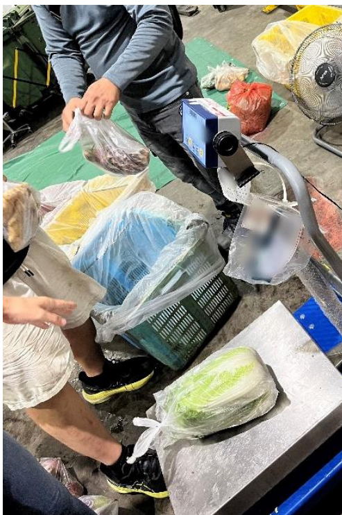
Produce is weighed and the total weight is tallied

4 SFA is following up with further investigations and will not hesitate to take enforcement action.