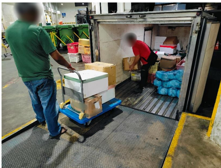
Truck drivers unloading the imports for inspection

5 In Singapore, food imports must meet SFA's requirements. Illegally imported produce and food products of unknown sources can pose a food safety risk. Food can only be imported by licensed importers, and every consignment must be declared and accompanied with a valid import permit. Illegally imported food products are of unknown sources and pose a food safety risk.