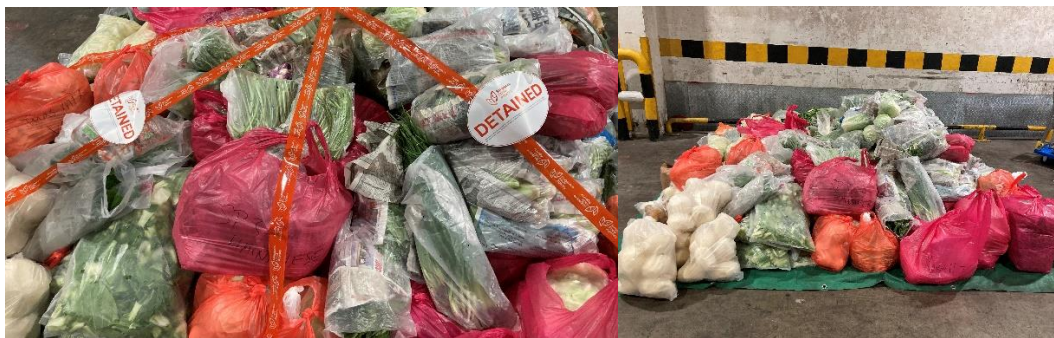
Illegal imports were seized

5 In Singapore, food imports must meet SFA's requirements. Fruits and vegetables can only be imported by licensed importers, and every consignment must be declared and accompanied with a valid import permit. Illegally imported produce is of unknown sources and can pose a food safety risk (e.g. if unregulated or high level of pesticides are used). The long-term ingestion of excessive pesticide residues through the consumption of vegetables and fruits that have been subjected to pesticide abuse could lead to adverse health effects.