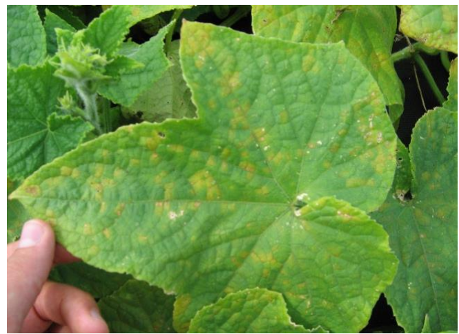
Downy mildew – cucurbit.