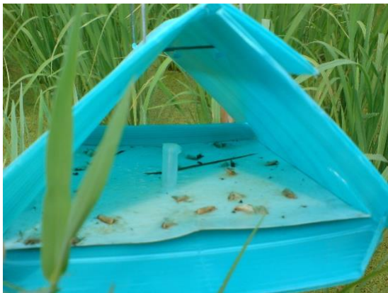
Pheromone trap. Image from Mehdi

Cons: non-specific so may trap a large number of insects, both pests and natural enemies of the pests which may affect their biological control potential in the area. Heavy rainfall could reduce stickiness of trap and will need to be replaced more often.