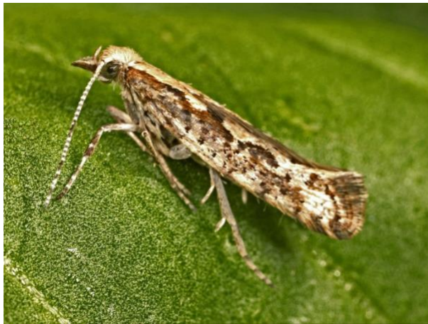
Diamondback moth – adult.