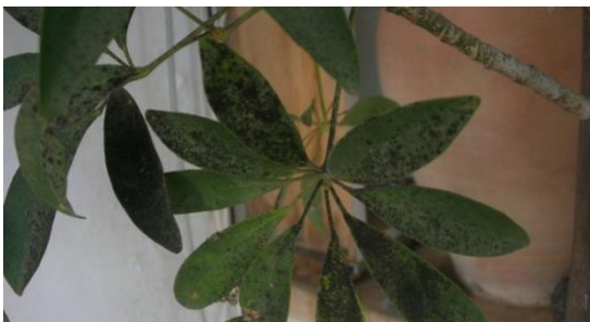
Aphids secrete honeydew that can lead to sooty mould.