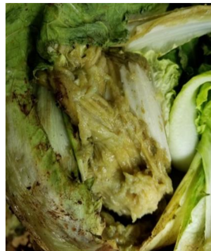
Bacterial rot - napa cabbage.