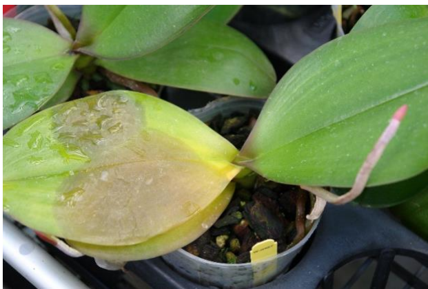
Water-soaked lesions caused by bacterial leaf blight.