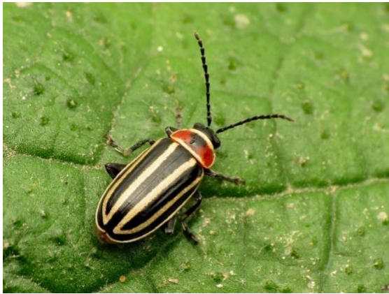
Striped flea beetle – adult.