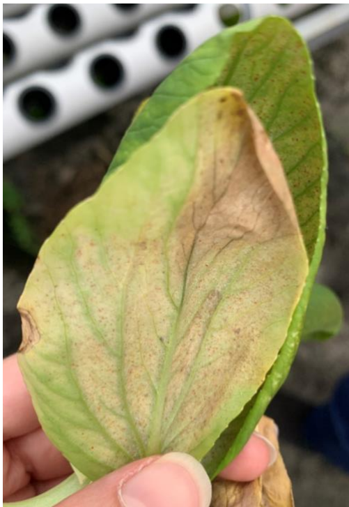
Tiny red dots on underside of leaves indicate spider mites.