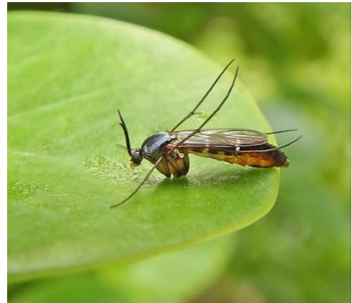
Fungus gnat – adult.