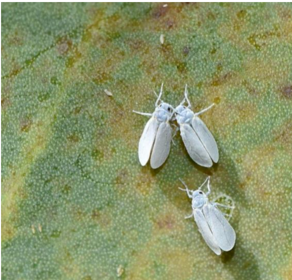
White fly – adult.