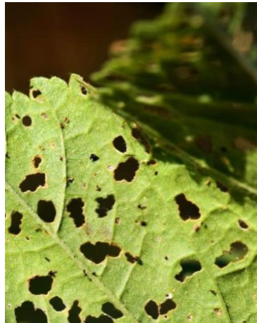
Flea beetle damage - small holes on leaves.