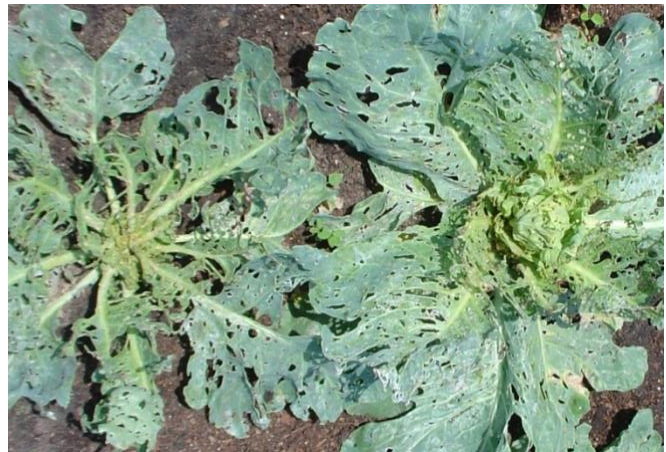
Diamondback moth larvae bites and creates holes in leaves.