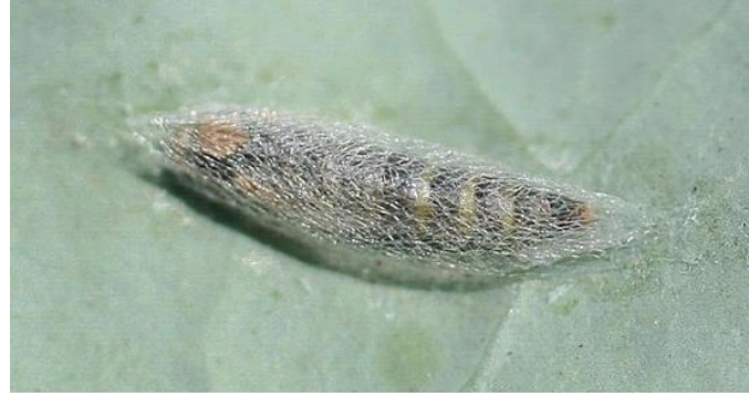
Diamondback moth – pupa.