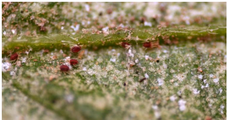
Spider mites on leaves - close up.