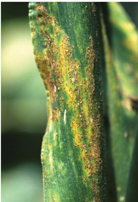
Leaf rust causes mass of brown spots on leaves. Image from International Maize and Wheat Improvement Center