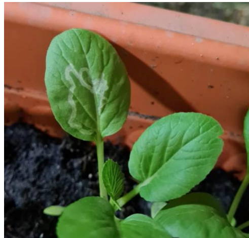
Mine trail made by leaf miner.