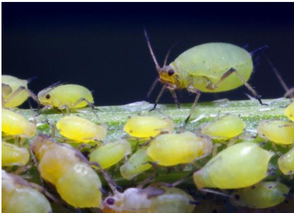
Aphids – adult.