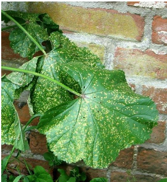
Leaf rust causes yellow spots on leaves.