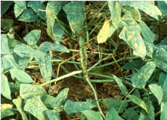
Thrips cause brown spots on leaves. Image from Institute of Tropical Agriculture