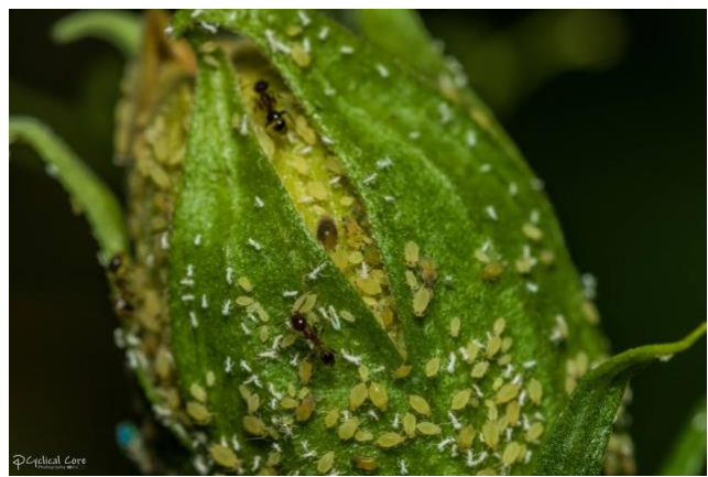
Aphids secrete honeydew that attracts ants.