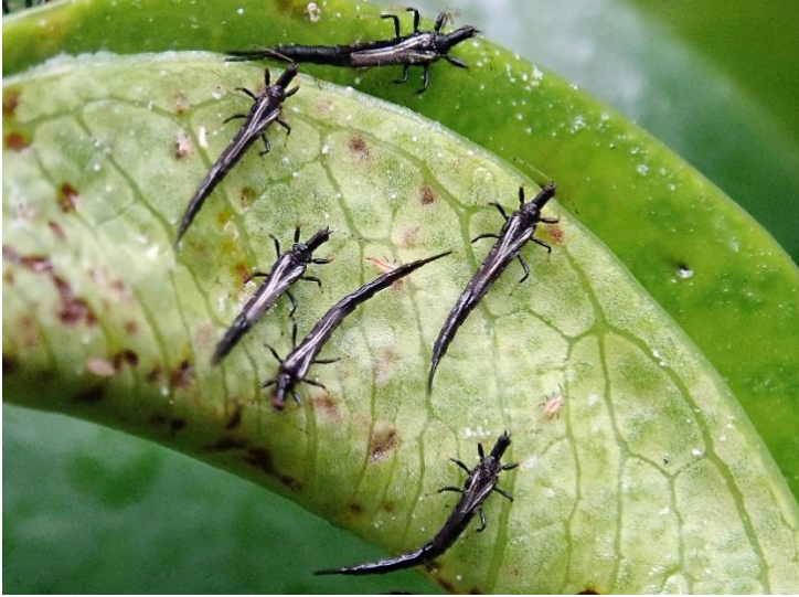
Thrips – adult.