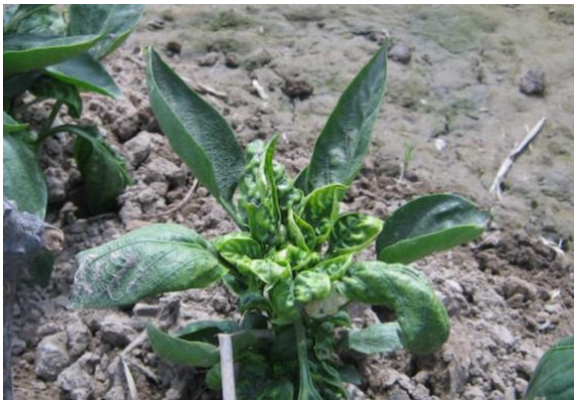
Viral leaf curl – capsicum. Image from LS2018