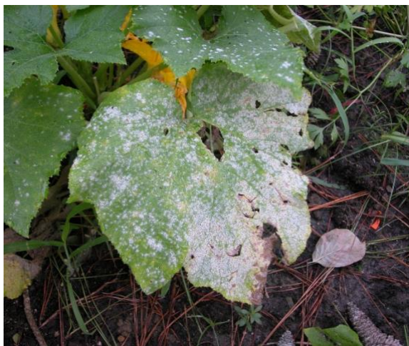
Powdery mildew.