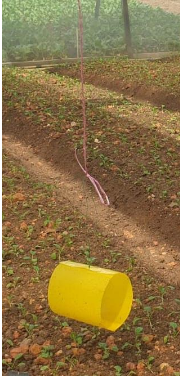
Yellow sticky trap.

Sticky traps can be placed hanged on poles, ceiling or growing system. Yellow sticky traps are used to trap adult leaf miners, aphids, whiteflies and fungus gnats. Blue sticky traps are used for thrips.