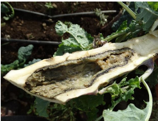
Bacterial rot – kale stem. Image from Awkwafaba