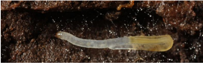
Fungus gnat – larvae.