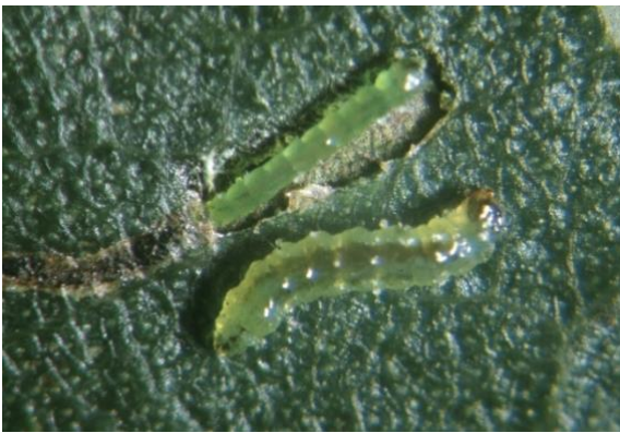
Leaf miner – larvae.