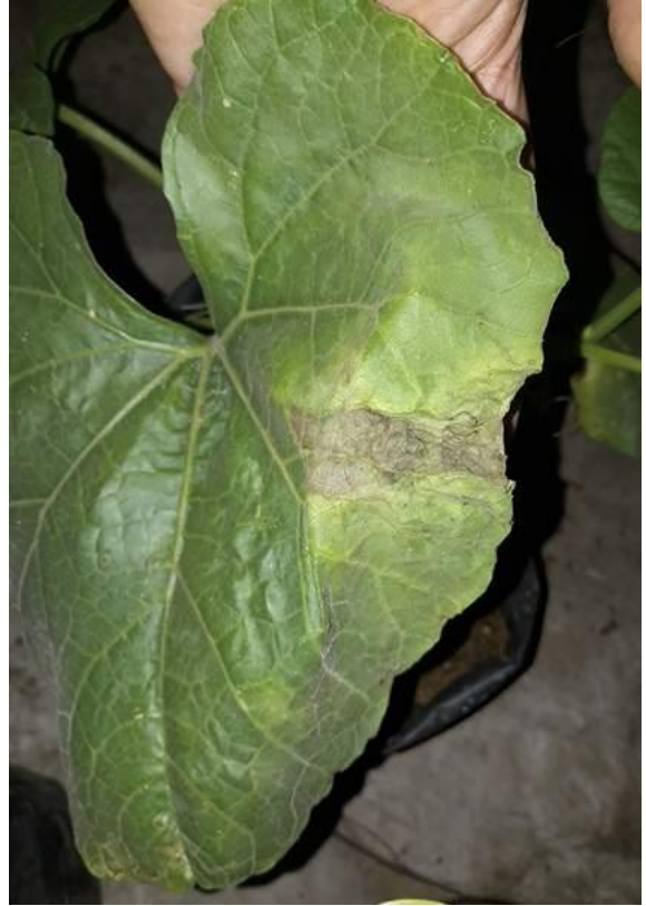
Brown areas develop between leaf veins due to thrips.