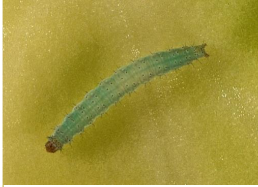
Diamondback moth – larvae.