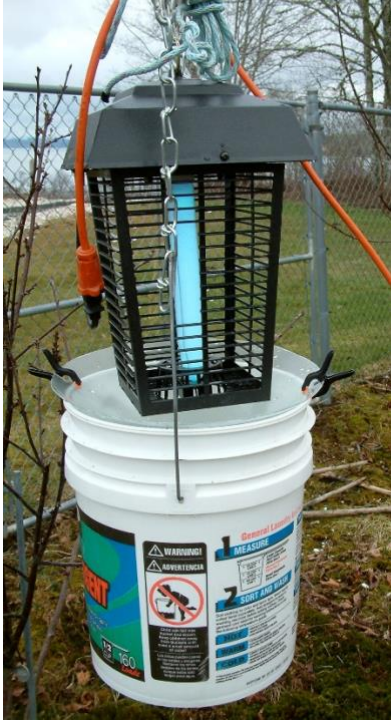
Light trap.

Light traps are suitable for species attracted to light, such as moths. Combine lights with sticky traps.