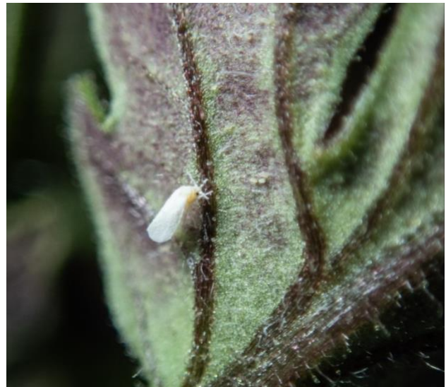
White fly - adult on tomato plant.