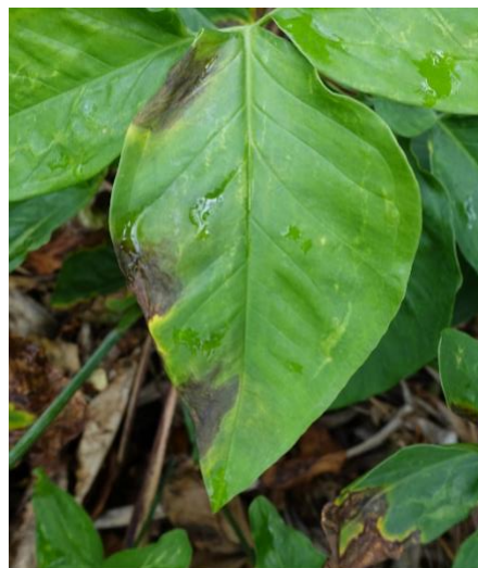
Darkened lesions on leaves caused by bacterial leaf blight.