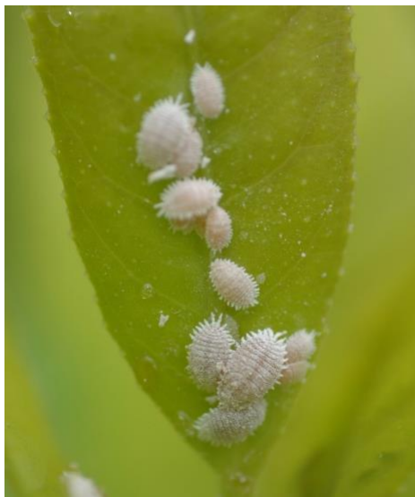
Mealybugs – adult.