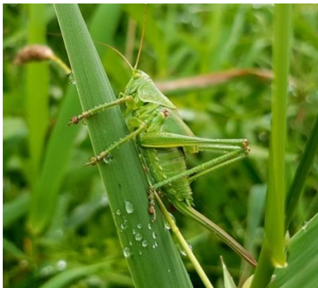
Grasshopper – adult. Image acquired with CCO Public Domain