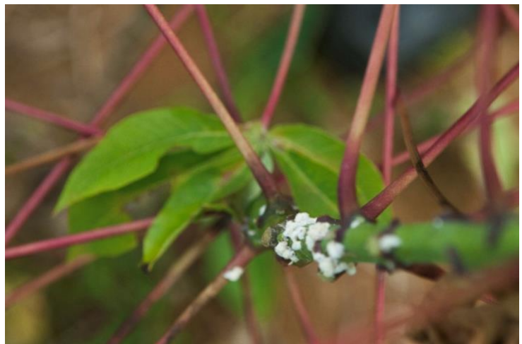
Mealybugs often found in colonies.