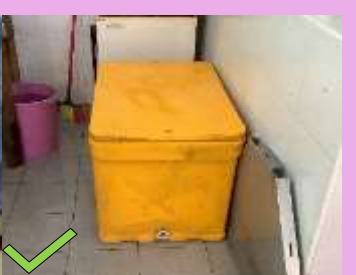
Frozen items stored inside insulated container