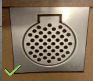
Covered gully trap