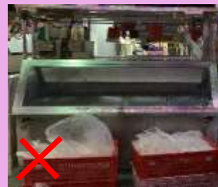
Raw meat left unattended at ambient temperature