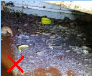
Food remnants underneath cooking range