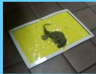
Rat caught on glue board