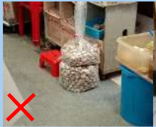
Food items placed directly on the floor