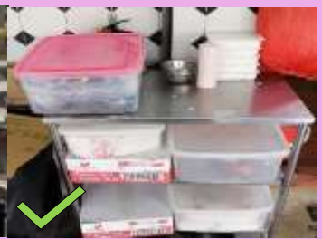
Food items stored in covered containers