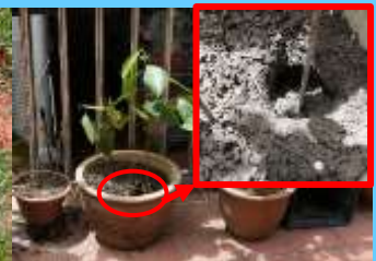
Rat burrow in flowerpot