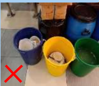
Uncovered soiled crockeries