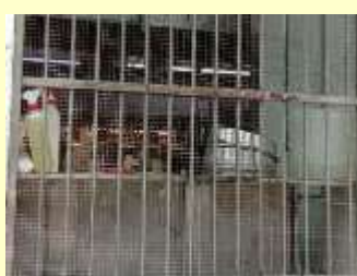
Wire mesh intact & properly secured