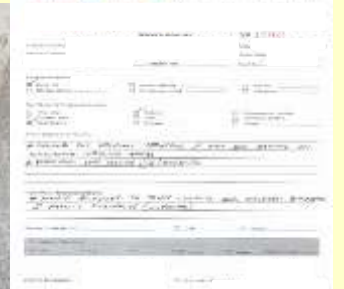
Conduct monthly pest control treatment