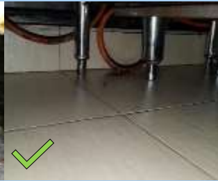
Clean floor under cabinet