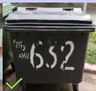
Clean & covered bulk bin