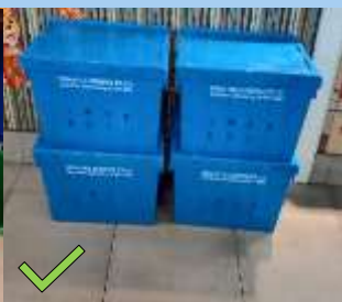
Soiled crockeries in containers