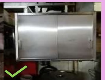
Duck meat stored inside cabinet of food stall overnight