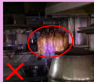
Duck meat left hanging inside food stall overnight