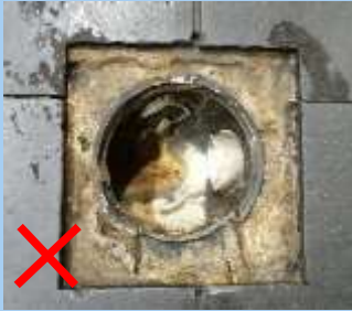
Missing gully trap cover