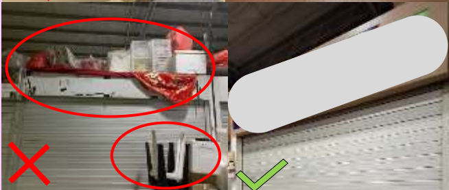
Poor housekeeping & storage of items at common area & above stall