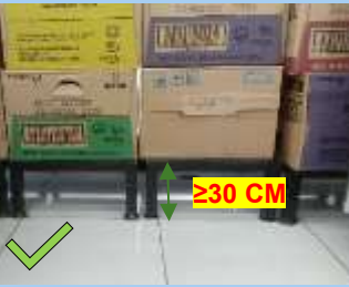
Food items placed at least 30 cm above the floor