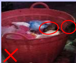
Rats nibbling on food waste in uncovered refuse bin