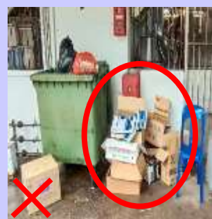
Uncovered & overflowing bulk bin