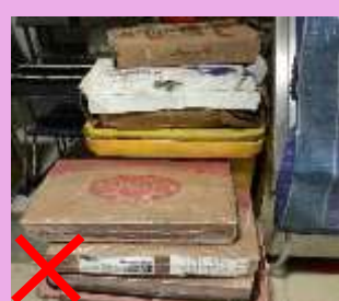
Frozen items left unattended at ambient temperature