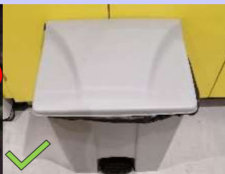
Covered refuse bin lined with plastic bag