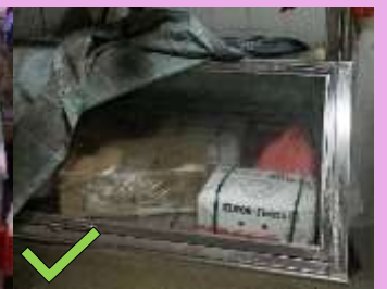
Raw meat stored inside chiller