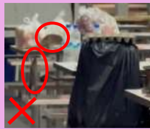
Rats nibbling on food left unattended