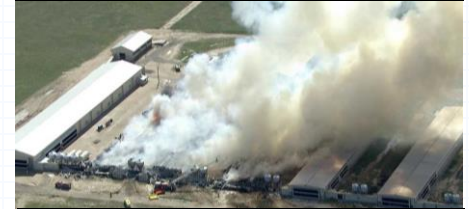
In 2012, 500,000 chickens died in a fire at Chicken Egg farm at Denver, USA.