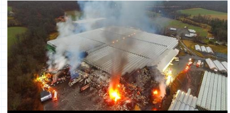
In 2017, Greenhouse fire in Pennsylvania, USA. The roof of the building collapse.