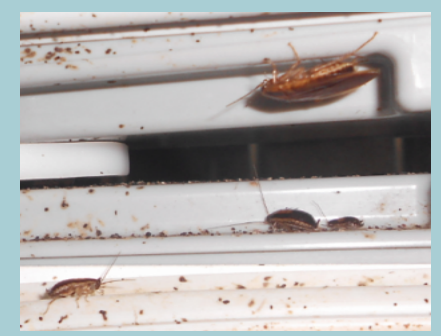
Gaps (e.g. rice buckets cover/handles, chiller/freezer gasket)