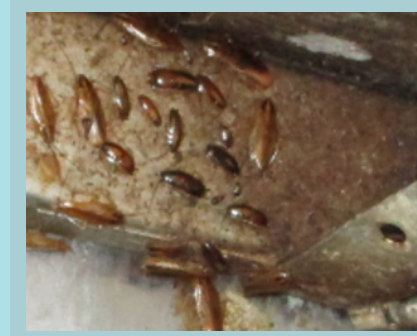
Underneath fixtures (e.g. table, cabinet, sink, etc.)