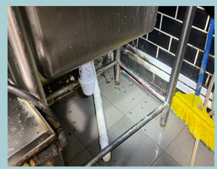
Underneath/back of bulky appliances (e.g chest freezers)