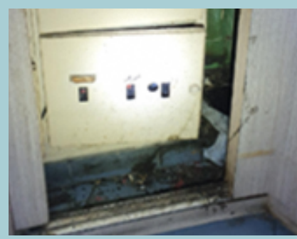
Crevices of wall